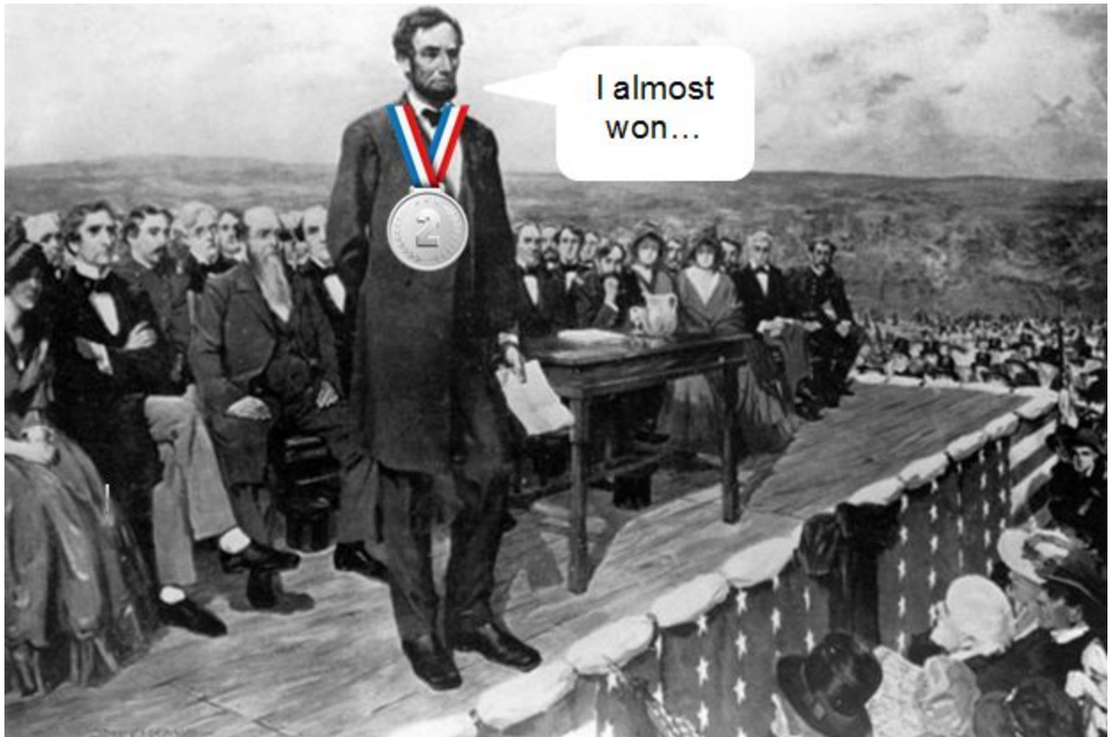
Photo #2: Abraham Lincoln won the election and became President of the United States.

Photo #1: Abraham Lincoln lost the election for Senator of Illinois.